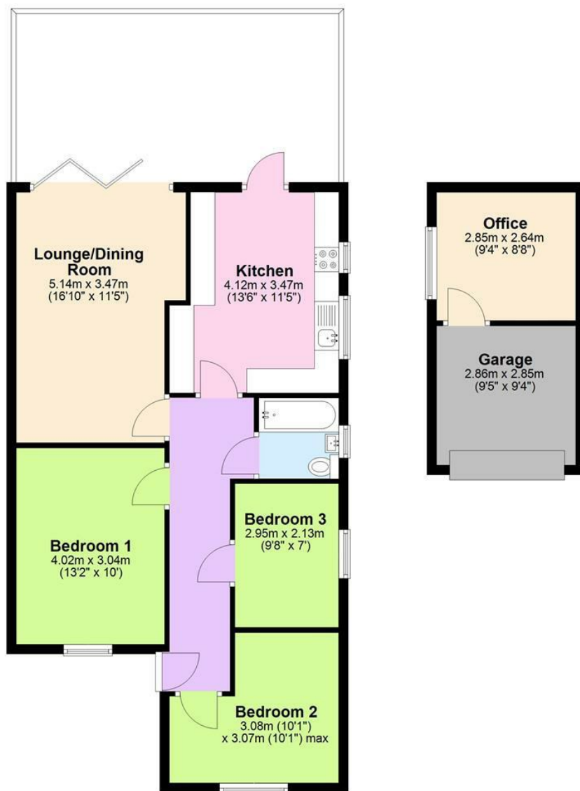
Total area: approx. 87.0 sq. metres (936.1 sq. feet)